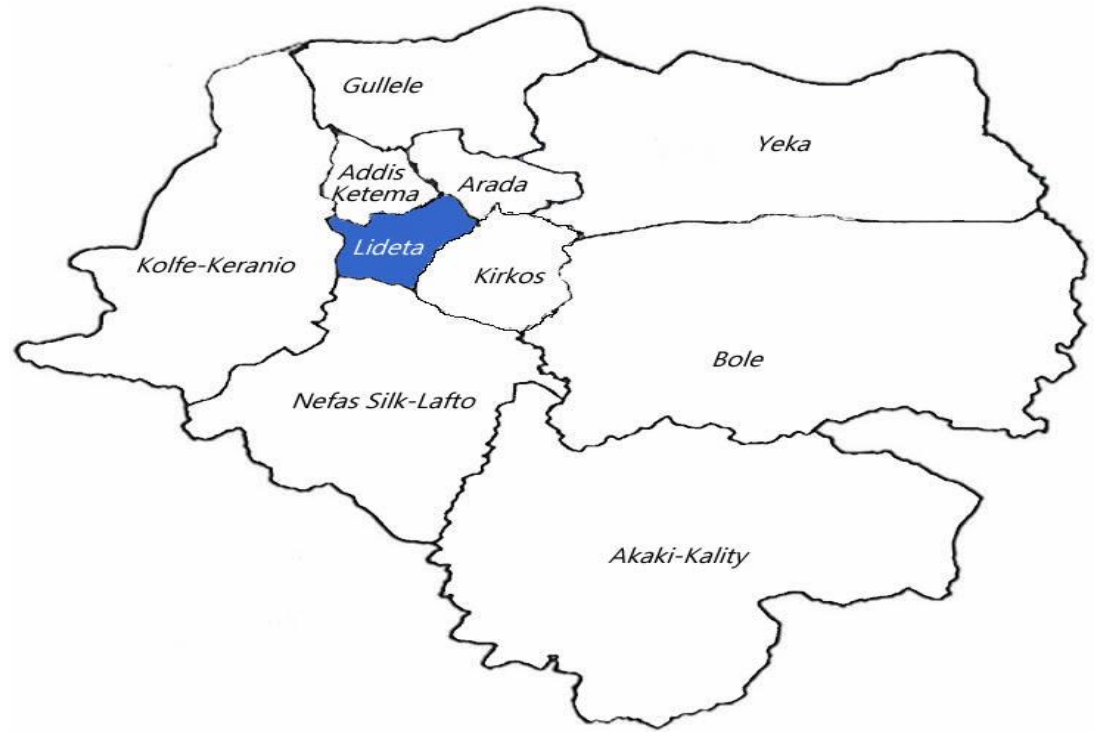
Figure-2. The map of Addis Ababa and Lideta sub-city.