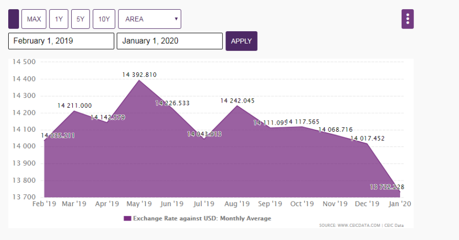
Figure-2. Exchange rate of Indonesia.